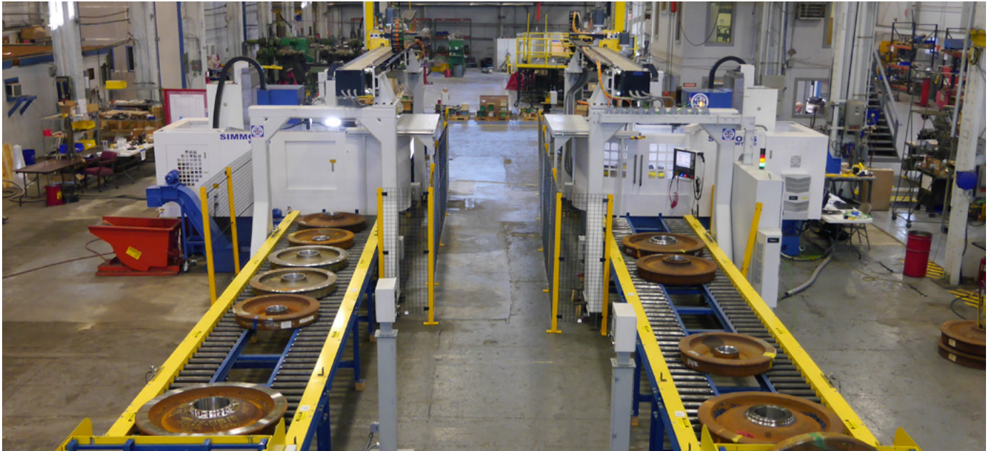
Figure 1: Wheel sets requiring machining are placed onto a conveyor and transported into the machine cell. To accomplish this task, each individual wheel is picked by a vertical lift system from Güdel. The system consists of a ZP-6 overhead gantry with a two-axis robot that has a Simmons specialized gripper to handle the heavy wheels. The system transfers the wheels to the Wheel Turning Center.