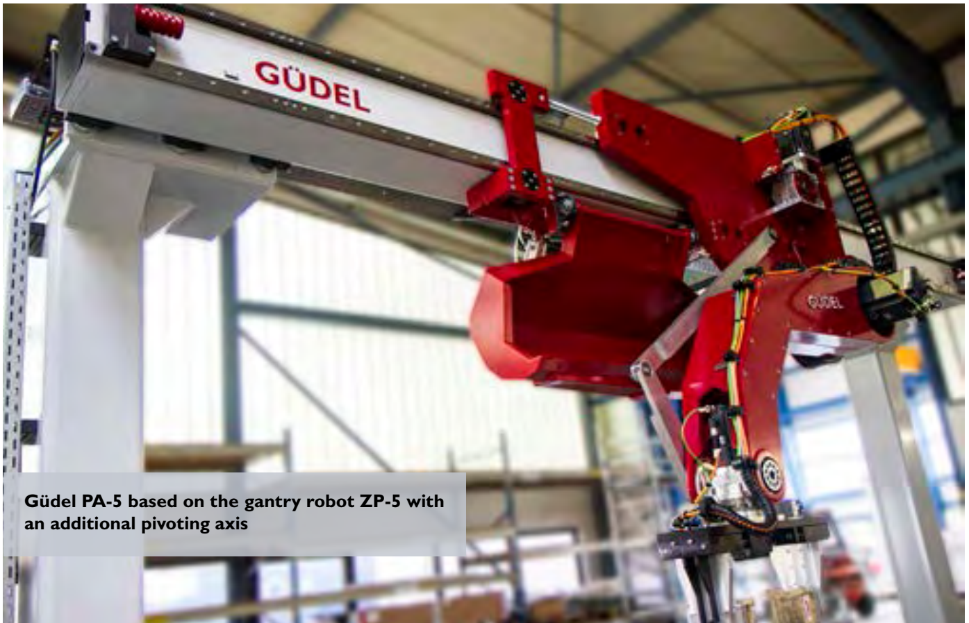
Güdel PA-5 based on the gantry robot ZP-5 with an additional pivoting axis