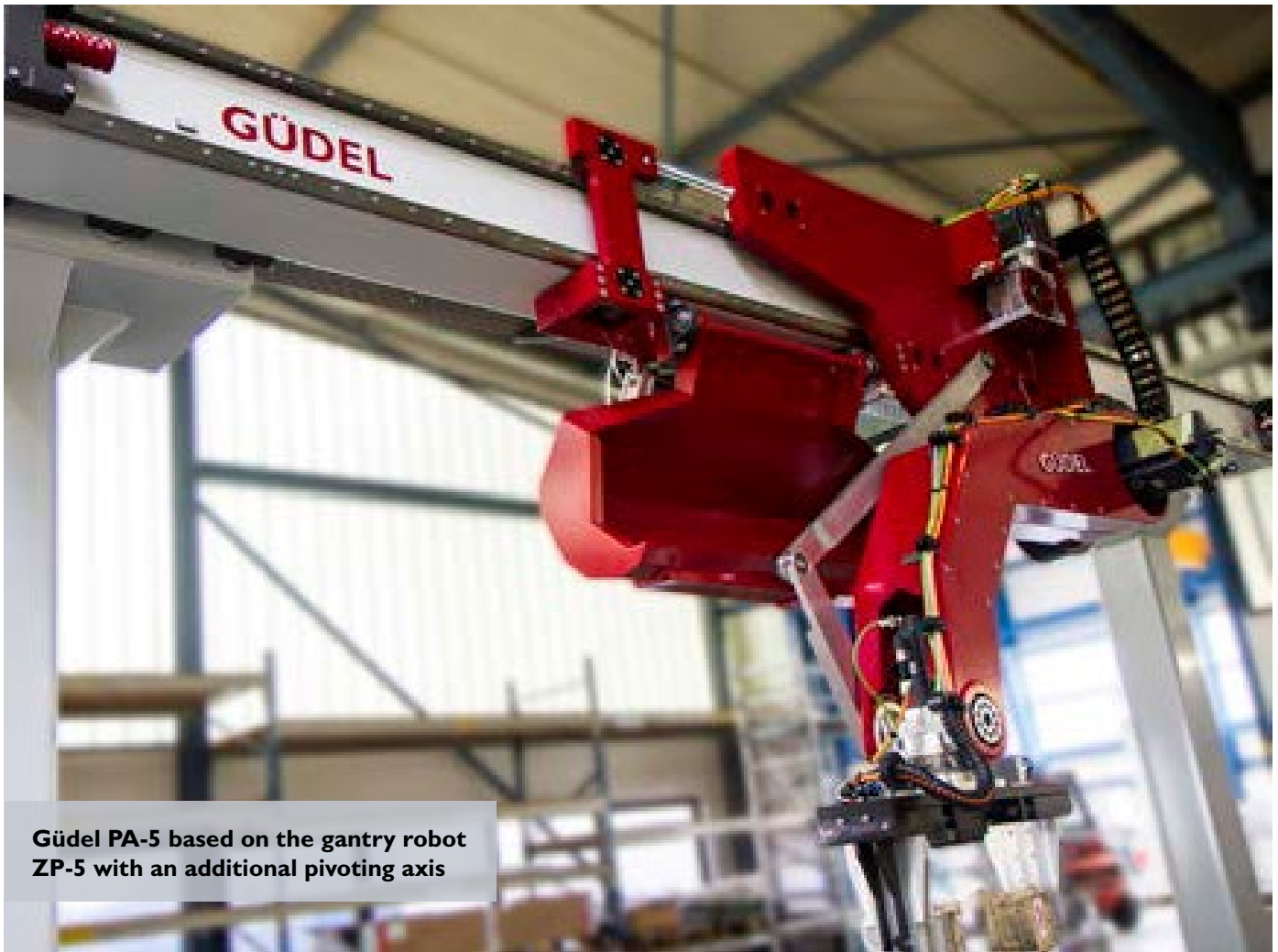
Güdel PA-5 based on the gantry robot ZP-5 with an additional pivoting axis